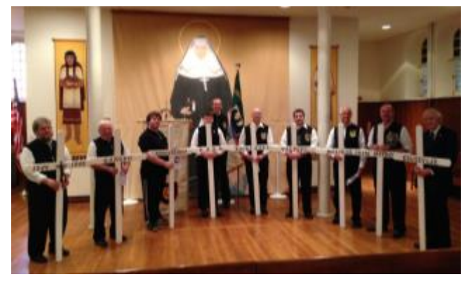
Club members carry crosses representing each of the death camps