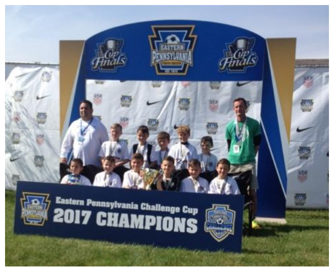
Danubia Soccer Club teams celebrate their championship victory

https://northeasttimes.com/danubia-soccerclub-brings-home-two-state-championships-5df54ede20cd