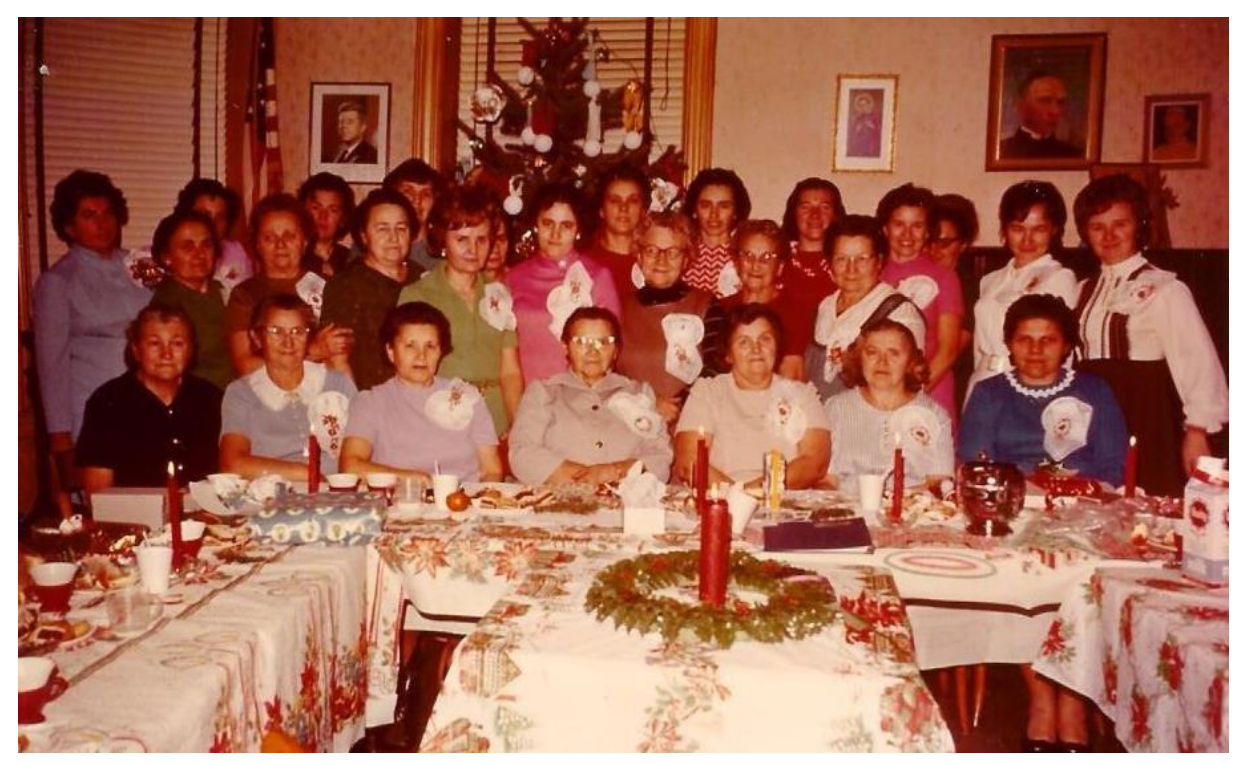
Donauschwaben Ladies Christmas Party and Luncheon in the Kolping House taken in 1971 before the Club House was built