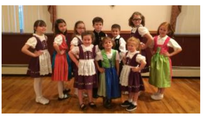
2017 Philadelphia Donauschwaben Kindergruppe

As always, we welcome you to contribute to our future newsletter issues by sending an email to newsletter@danubeswabian.com or by talking with a club representative. Have a great rest of your summer!