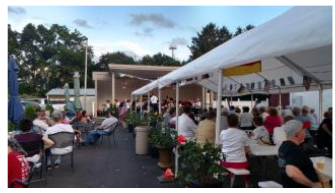
Cardinal Dougherty Alumni Band performs at the 2017 Summer Concert Series

The Band is now extending its reach beyond those who attended Cardinal Dougherty High. It was heartening to see some children of the alums playing in the ensemble as it helps ensure not only the future of the organization, but also the future of this form of music. When you think about it, this applies to your Club as well. Introducing younger people and reintroducing those who were once involved are the two most important ways we can ensure the sporting and cultural aspects of our heritage will be around for future generations. Please come to your club and see all that we do!