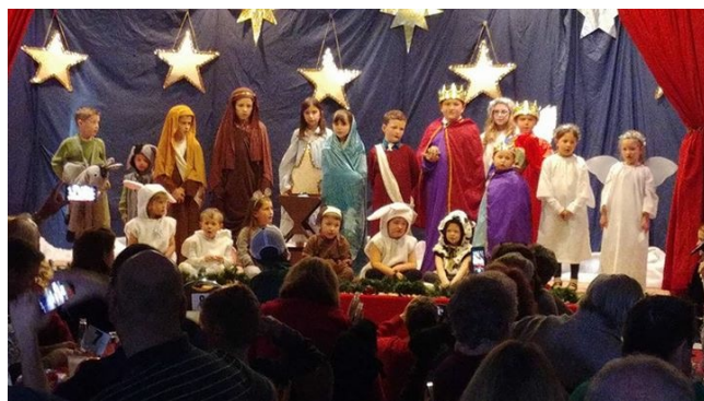
Children reenacting the Nativity scene