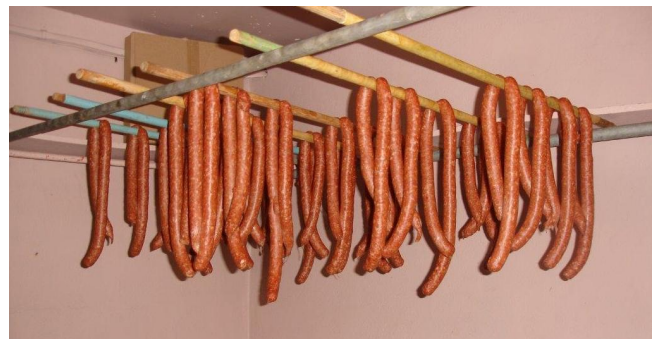
Bratwurst looks delicious!