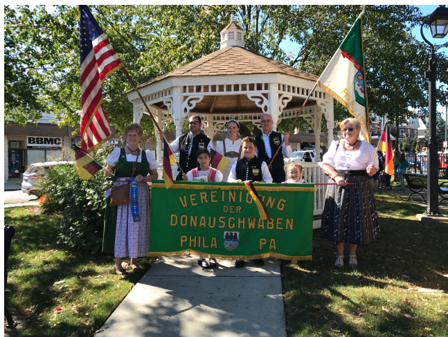
Club members participate in the 2017 German-American Steuben Parade

At the conclusion of the parade, many of us found ourselves back at the Hop Angel or the Austrian Village enjoying some great food, music, and of course, a well-deserved beer after the long march in the parade.