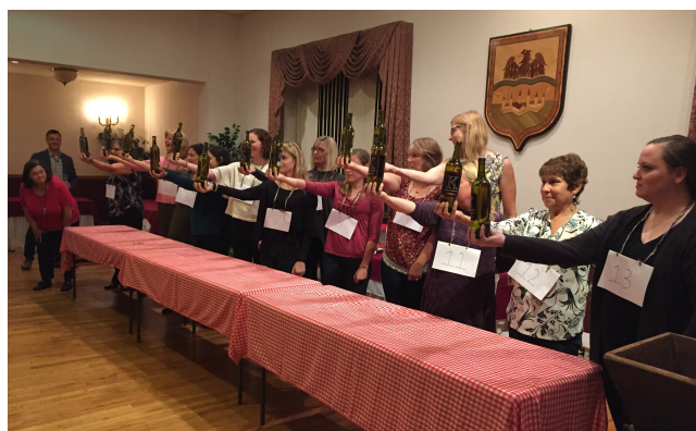
A friendly competition at the wine tasting event