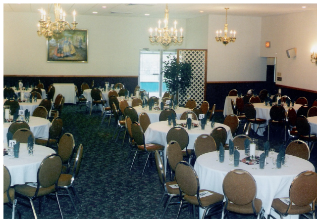
Upstairs hall available for rental for your next event

Did you know that if you are a club member, you can rent the hall for a birthday party, wedding reception, Baptism, or other special event? We offer a variety of packages for those interested in renting the hall. Not a member yet? Consider submitting a membership application first and then talk with our hall rental coordination about your options. What better place than the Danube Swabian Association to plan your next event!