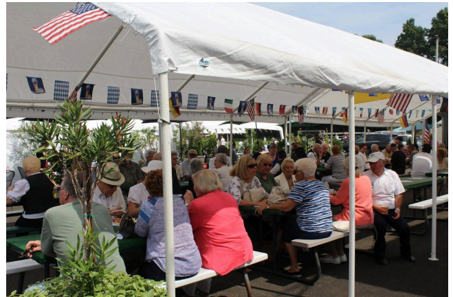
Club members, friends, and guests enjoying an afternoon under the tent