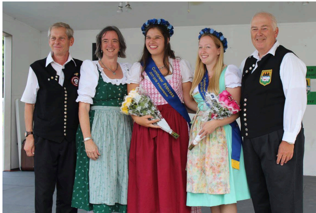
Presentation to the Cornflower Queen and Princess

Thank you to all who came to Tag der Donauschwaben this year and to all those who helped with the planning, the setup, the food service, the bartending, and the cleanup!