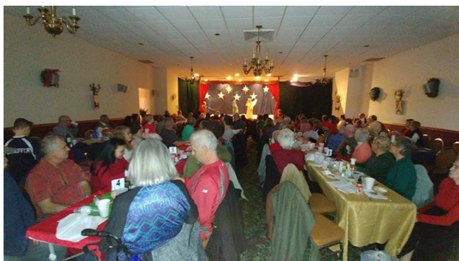
The upstairs hall was full for the annual Children's Christmas Show

While the hard work of all of the bakers and parents who set up and practiced the play is appreciated, it was really nice to see the older children take larger roles as scene changers and narrators. The play was a perfect combination of fun and solemnity of the holy season. It was a wonderful way to prepare all in attendance for Christmas.