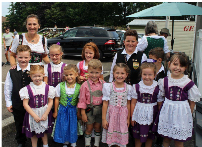
Children's Dance Group