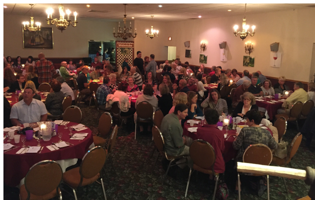
The upstairs hall was full for the third annual wine tasting event!