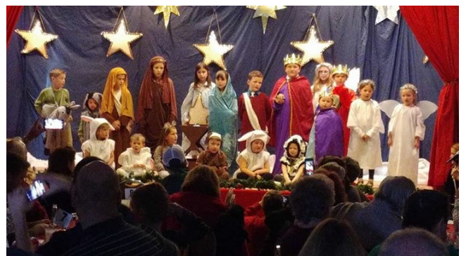
2017 Children's Christmas Show

To make reservations, please call Hans at 267-770-6898 or Fred at 215-722-4253.