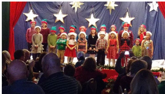
Children sing Christmas carols at the annual Christmas Show