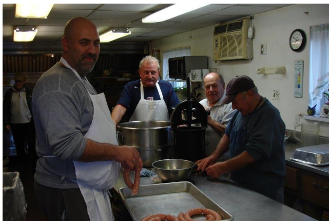
Schlachters prepare the meats for the dinner