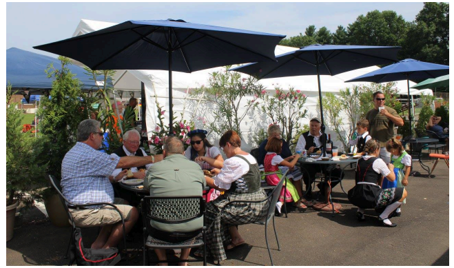
Enjoying the beautiful weather