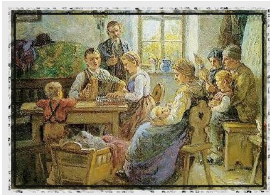
“Schwäbisches Hauskonzert” by STEFAN JÄGER

They all sit down at the table sharing not only the hearty meal but each other’s company. They stop once before they eat to give thanks to their heavenly father, for giving them this food, this family and this promised land. The food on this table is home grown and raised. It is prepared with care and practice from recipes passed down from generations.